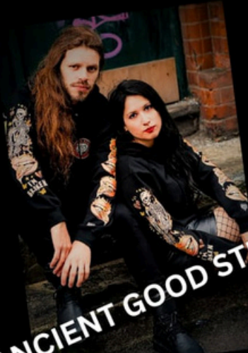
ANCIENT GOOD STUFF

Light refreshments will be available with some music, dance and poetry by LGBTQIA+ performers